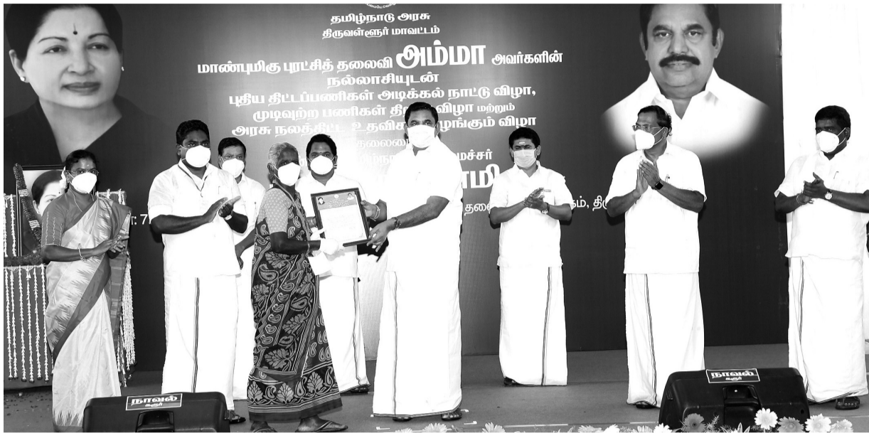
Chief Minister Palaniswami distributed welfare assistance to the beneficiaries under various welfare schemes of the Government at the function held at Tiruvallur district collectorate. Rural Industries Minister Benjamin, Tamil Culture Minister Pandiarajan, Tiruvallur collector Maheswari Ravikumar, MLAs were present at the function.