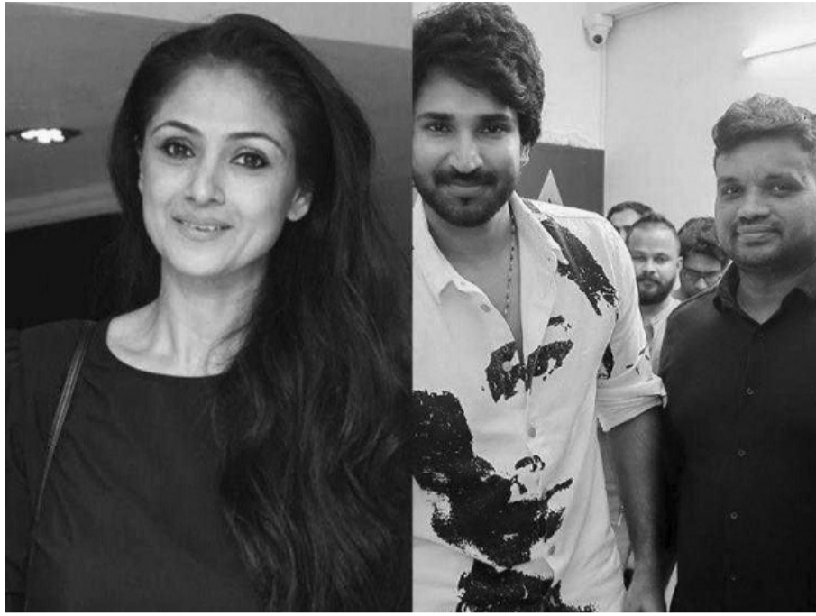
Starring @AadhiOfficial An @dirarivazhagan Film A @MusicThaman Musical" Actress Simran wrote, "Thank you @dirarivazhagan happy to be part of young and talented team of #sabdham" Actor Aadhi and director Arivazhagan have joined hands again after 13 years for a horror film titled 'Sabdham'.

Welcoming the talented actress on board, director Arivazhagan wrote, "Welcoming Ever Green @ Simran bagga Offc onboard for #Sabdham